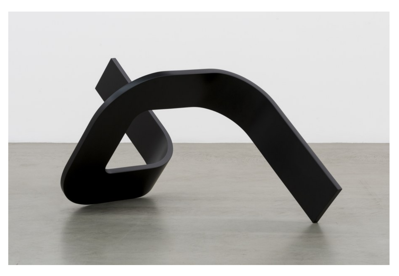
Tony DeLap, Modern Times, 1966, wood, fiberglass, and lacquer, 39 x 67-1/2 x 39 inches.

With work by five artists, it highlights the interest in perception that activated the work of Tony DeLap and Charles Ross. These artists were interested in ideas about mindfulness and seeing and spiritual presence. The show continues to Aug. 10.