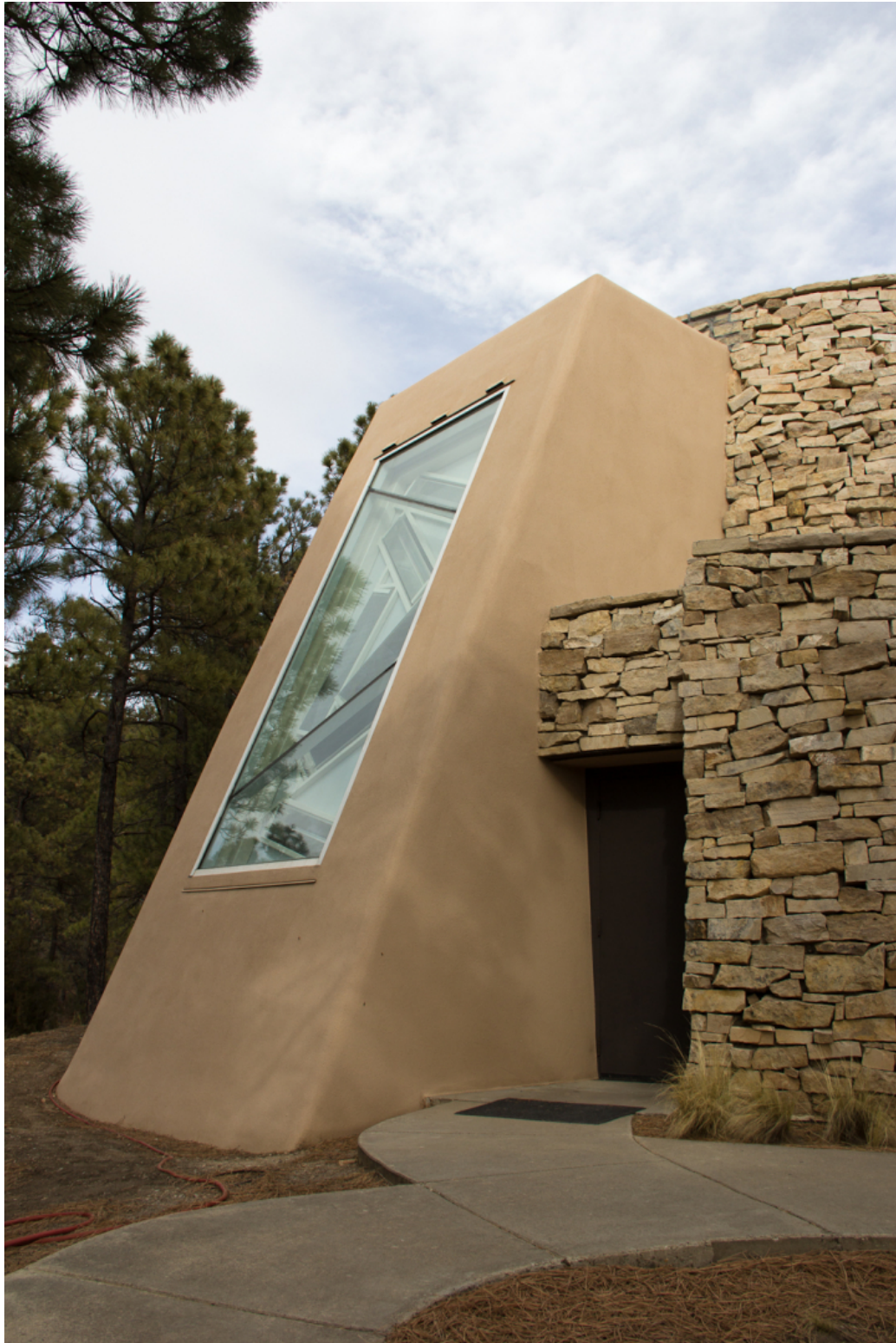
The exterior of the Dwan Light Sanctuary