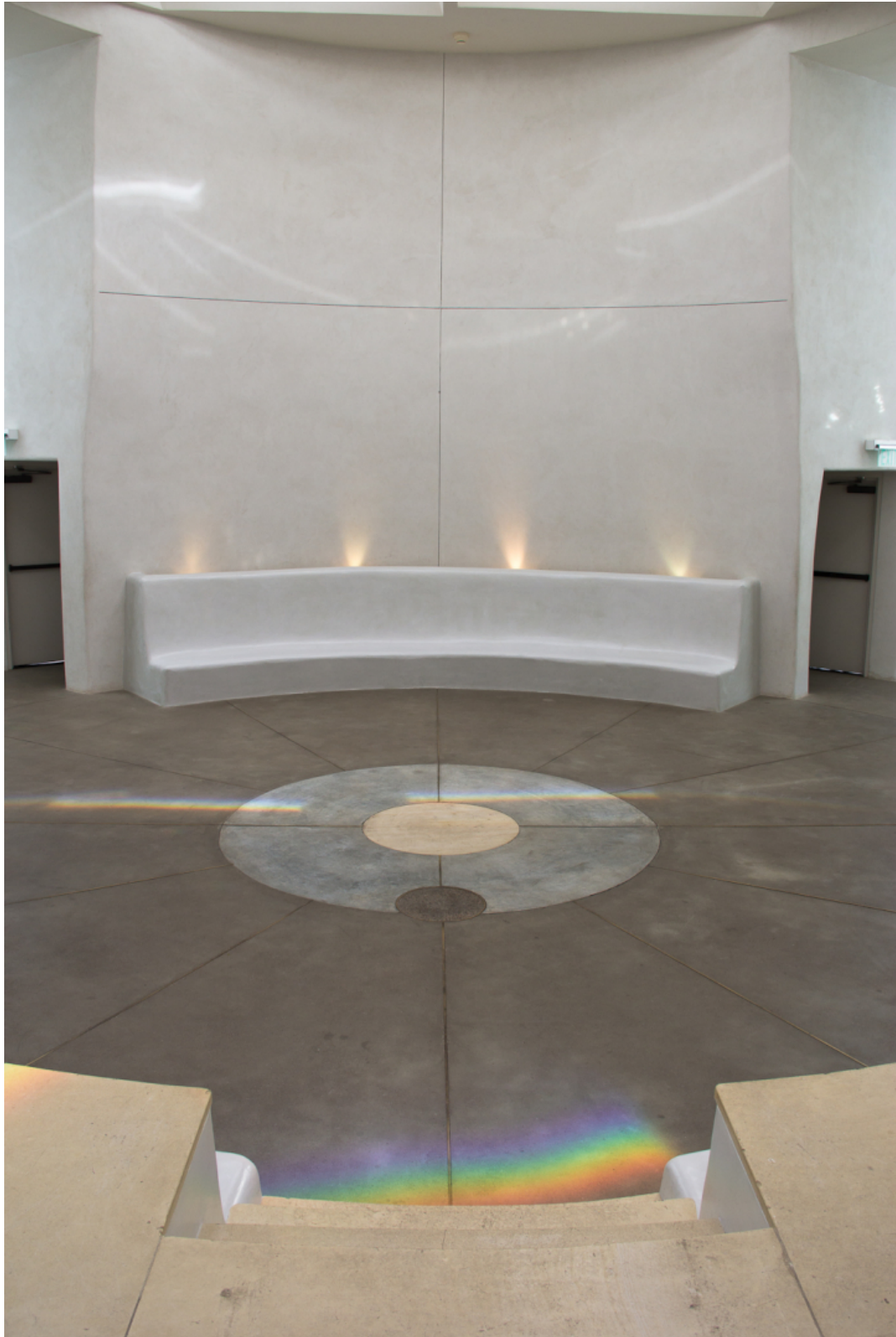
Seating in the sanctuary forms a circle around the center