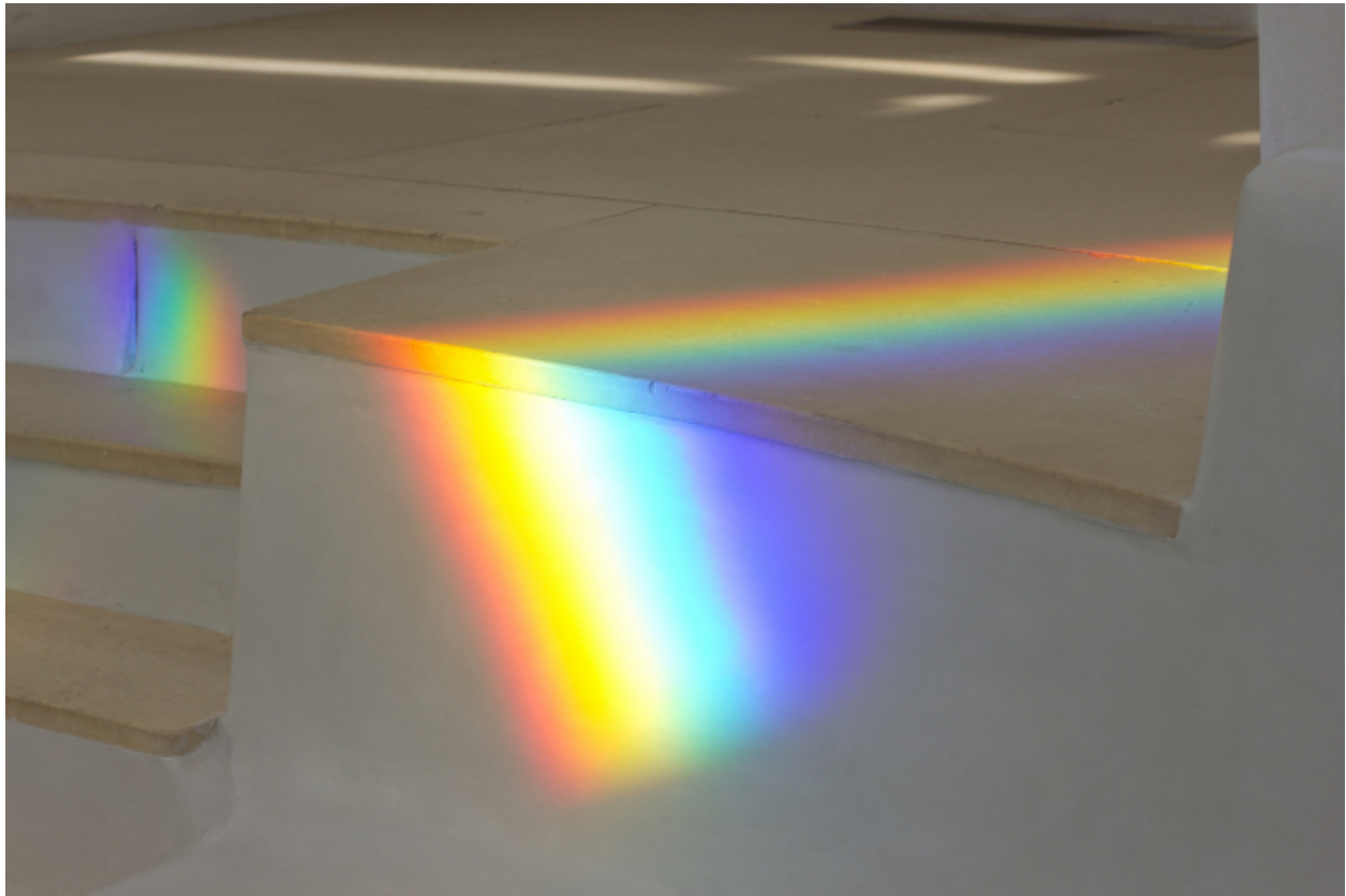
Rainbows are refracted across the sanctuary by prisms

The sanctuary is just over an hour's drive east of Santa Fe and is best seen on bright, sunny days for optimum light refractions. Upon approaching Montezuma Castle, one might think they have arrived at the Hogwarts School of Wizardry with the backdrop of mountains, turrets reaching toward the sky, and smiling students playing soccer on the front lawn. The light sanctuary is situated in a grove of ponderosa pines just adjacent to the castle and offers a complimentary if not contrasting experience.