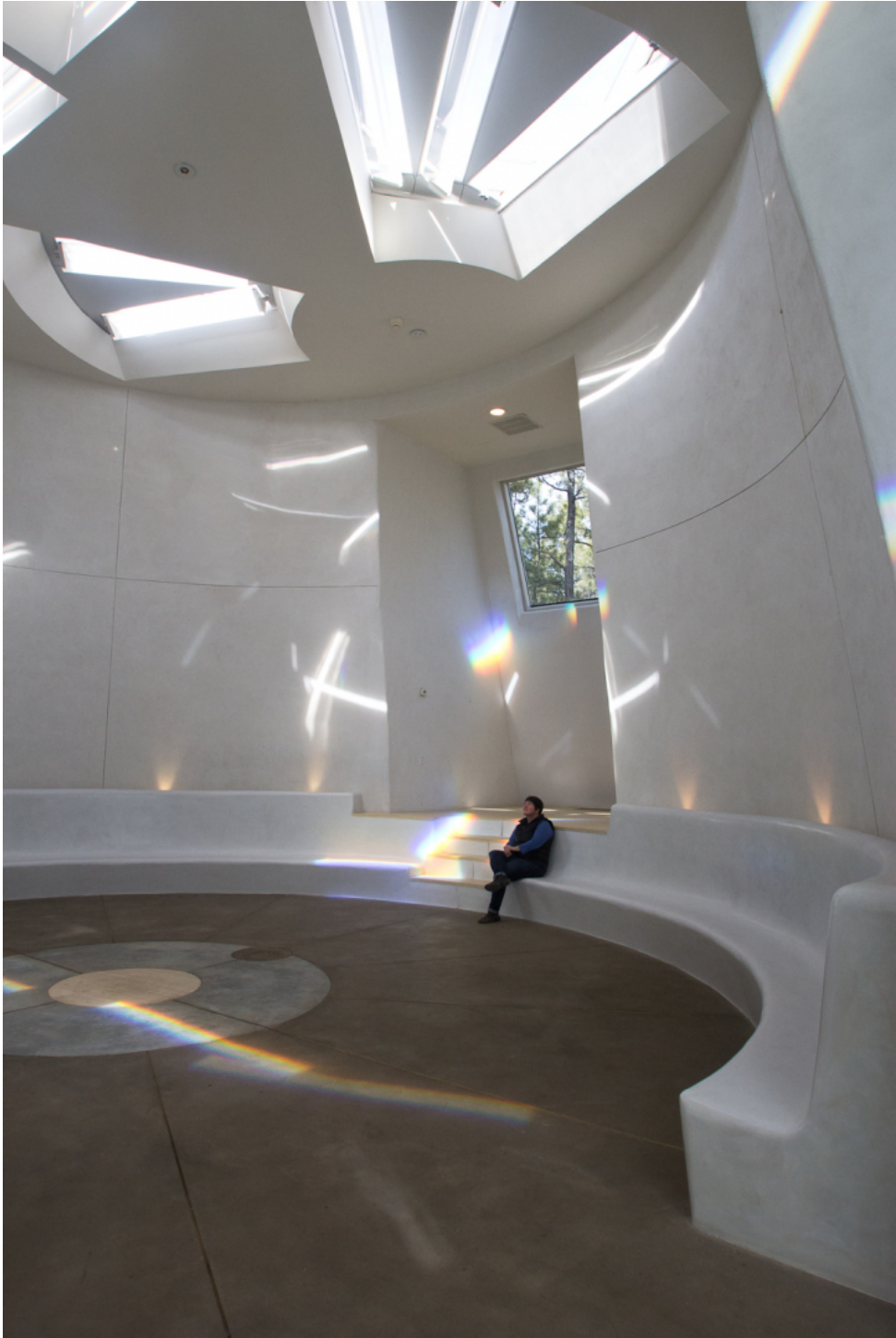
A visitor to the sanctuary