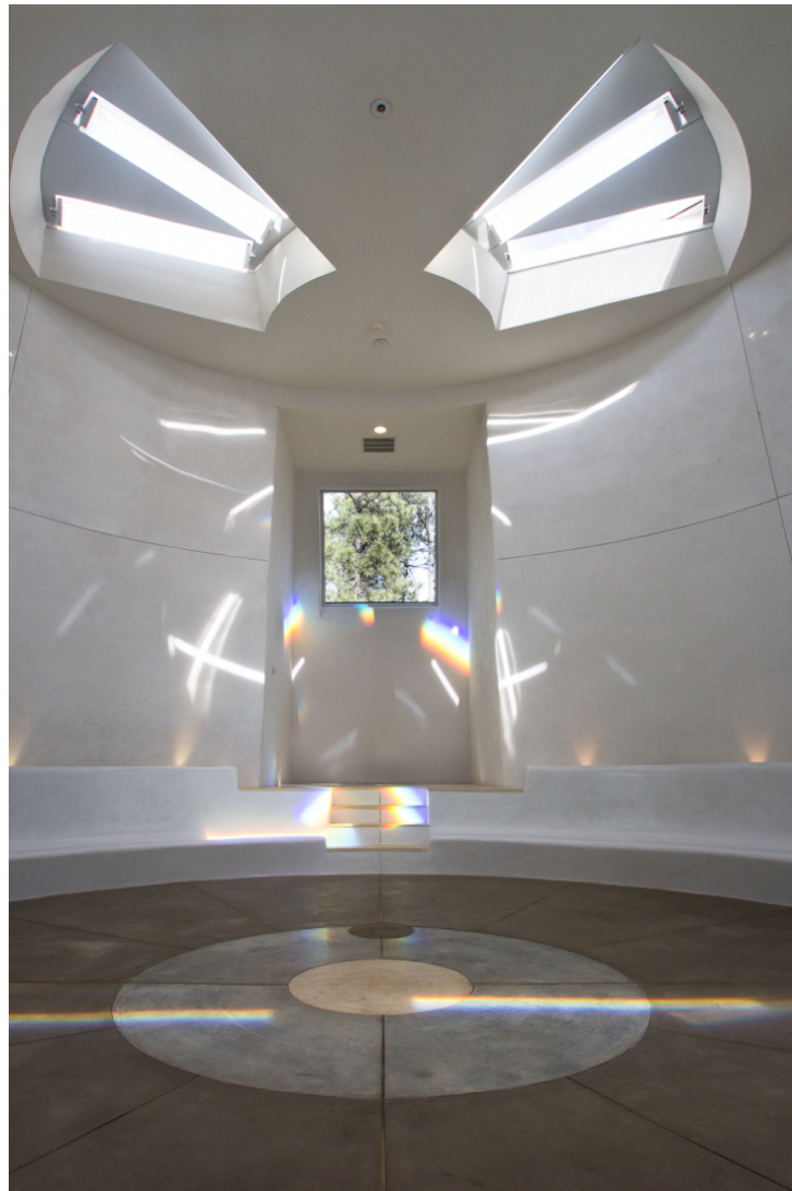
An apse in the Dwan Light Sanctuary in Montezuma, New Mexico