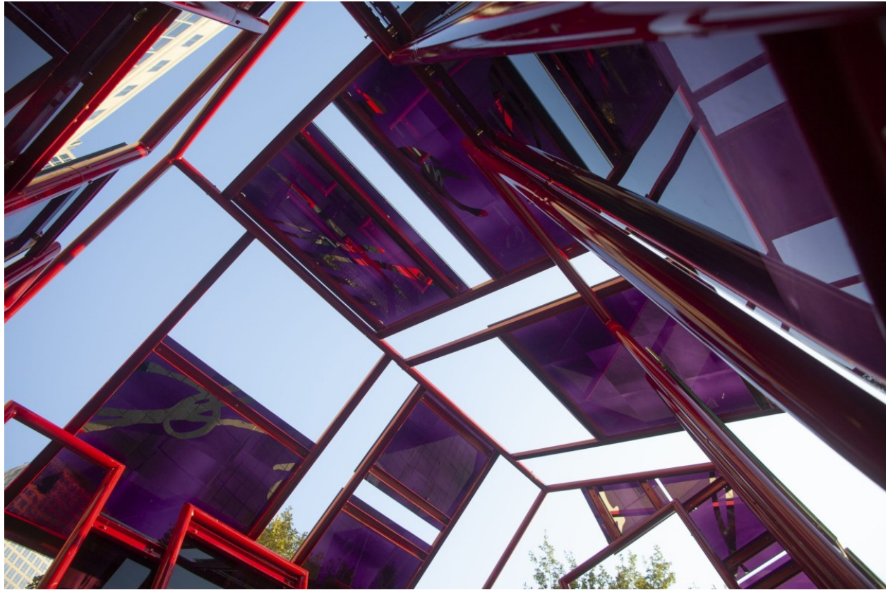
The mirrored surfaces of the glass panels that make up "The House That Will Not Pass For Any Color Than Its Own" reflect the work's red steel frame. Openings in the roof and walls reveal views of the sky and surroundings and subvert traditional function of a house, spurring questions about the meaning of home and homeland

by Battery Park City Authority February 11, 2021