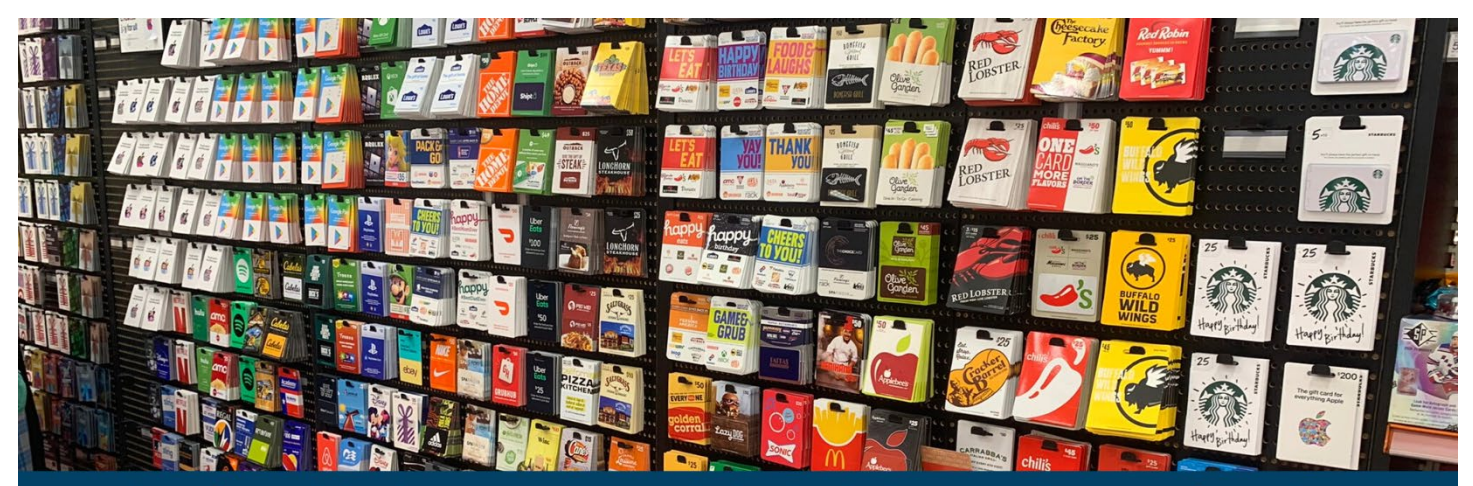
This gift card display at a Target includes both plastic and paper gift cards. An informal survey found that 70%+ were likely made from PVC.

Unfortunately, many big brand companies are choosing to use polyvinyl chloride (PVC) plastic to make their gift cards . Major retailers offer dozens of PVC gift cards for sale in their stores and informal surveys indicate that as much as 70% of the gift cards sold in stores are made from PVC plastic.