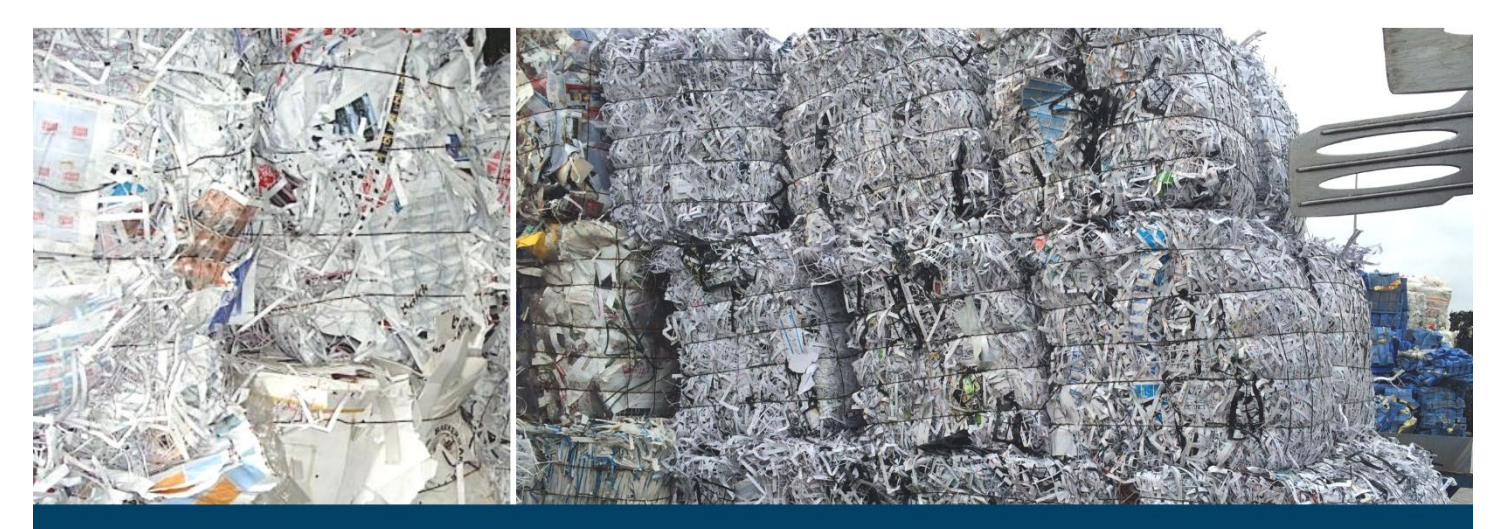
Baled PVC plastic waste left over from manufacturing cards.

U.S. PVC waste exports are violating the laws of countries that ban PVC imports, such as Malaysia, India, Turkey, and Mexico.<sup>11</sup> As noted above, the U.S. recycling rate for PVC is "negligible". In 2021, the U.S. exported 23.6 million kg of PVC waste (about 4,450 shipping containers/year).<sup>12</sup> PVC cards themselves may have also be exported as part of "mixed plastic waste" and as contamination in paper bales. PVC gift cards from U.S. mixed plastic waste exports have been found dumped and burned in Turkey.<sup>13,14</sup>