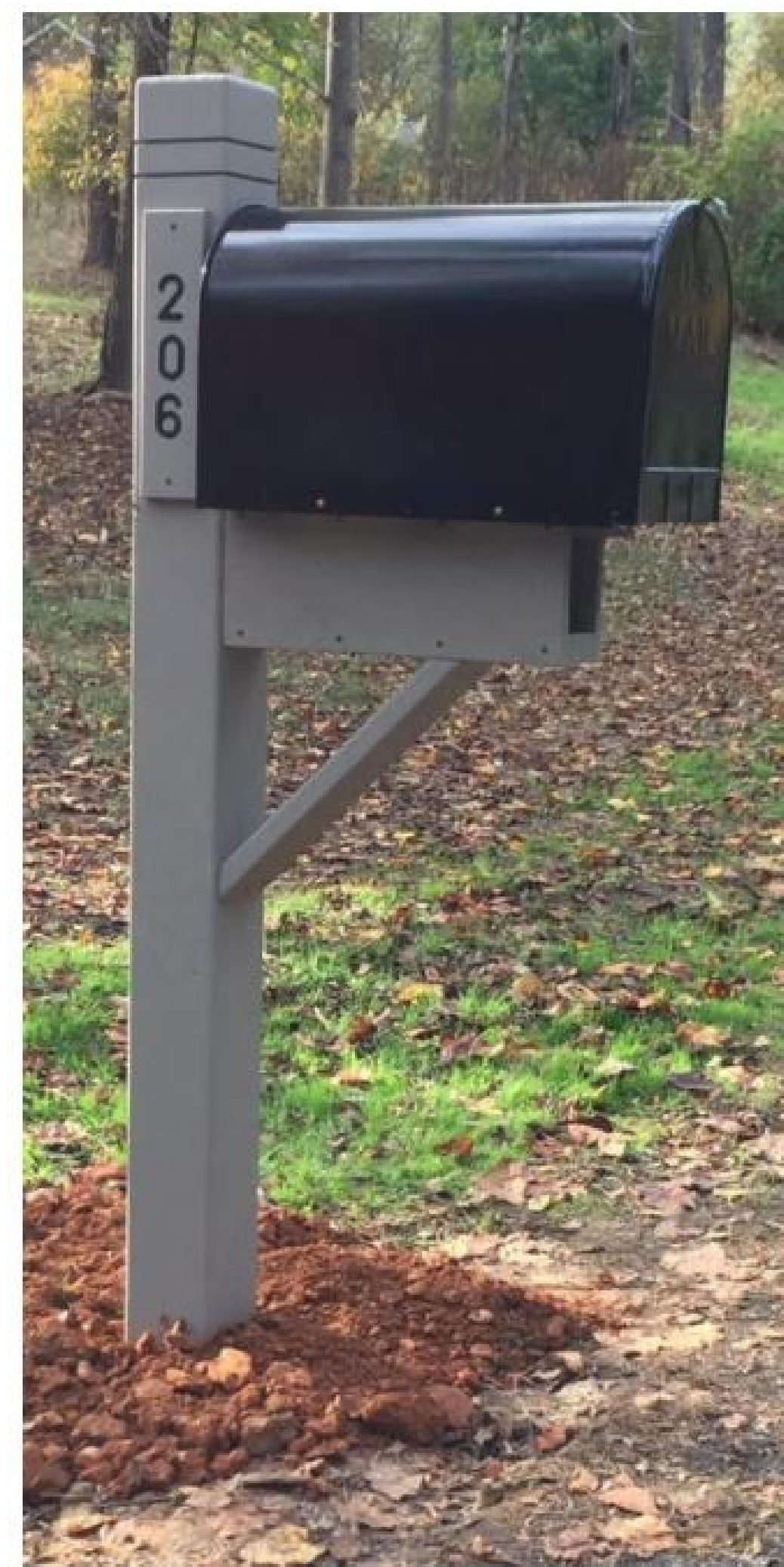
STONE CREEK MAIL AND PAPER BOXES: A SOURCE FOR MAIL AND NEWSPAPER BOX POSTS, WITH MAILBOXES (REGULAR AND JUMBO). THE POSTS AND MAILBOXES ARE APPROVED FOR USE BY THE WPOA ARCHITECTURAL REVIEW BOARD.