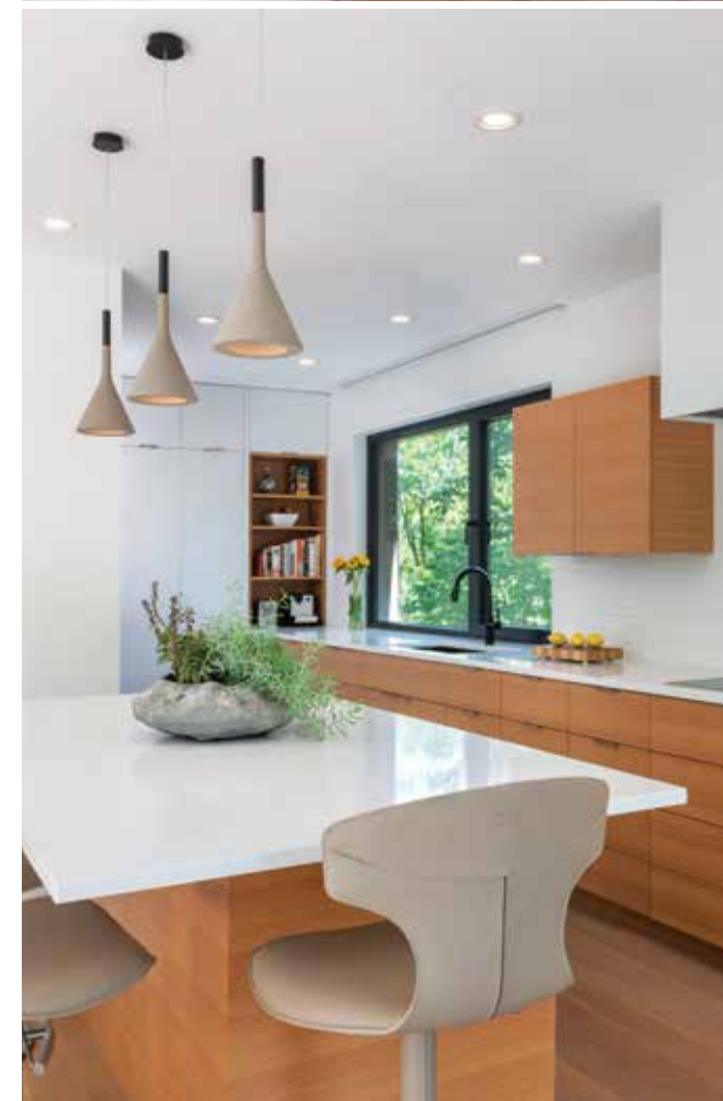
ABOVE: The living area opens onto a terrace in the front of the residence. LEFT: The sleek new kitchen features white-oak cabinetry and quartz countertops. FACING PAGE: The kitchen cabinetry extends into the breakfast area, which overlooks the front terrace. The family often enjoys alfresco meals, so easy access from the kitchen to the terrace was one of the client mandates.

similar footprint, with two wings connected by the main entry. The back of the home, where the in-law suite and the family room are located, sits a half-story below the front. The kitchen, living, and dining areas, in addition to the garage, comprise the front of the structure. If the kids are playing downstairs, they are still within earshot of the parents on the main level, but the space can also be closed off via a sliding glass door so noise doesn't travel.