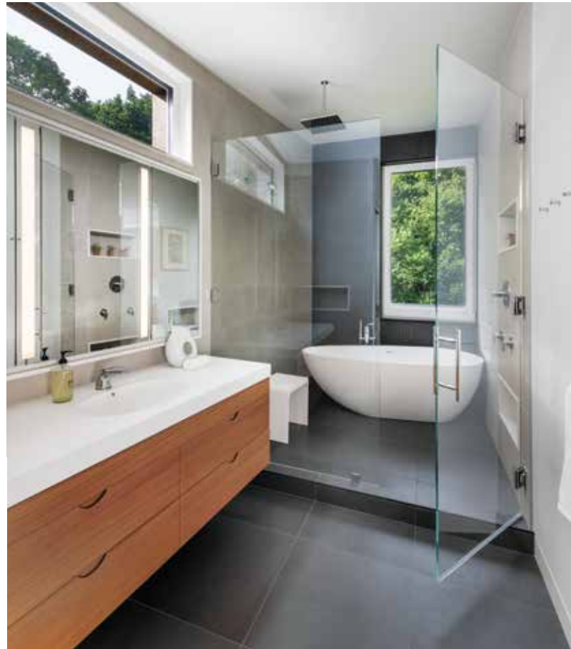
RIGHT: The primary bath features a custom white-oak vanity and a Badeloft tub. BELOW: The bluestone terrace in the front of the home is accessed by expansive sliding glass doors in the main living area. FACING PAGE: A glass entry in the rear of the house connects the two wings.

“The goal was to break down the barrier between inside and out,” says White. “We took advantage of the views