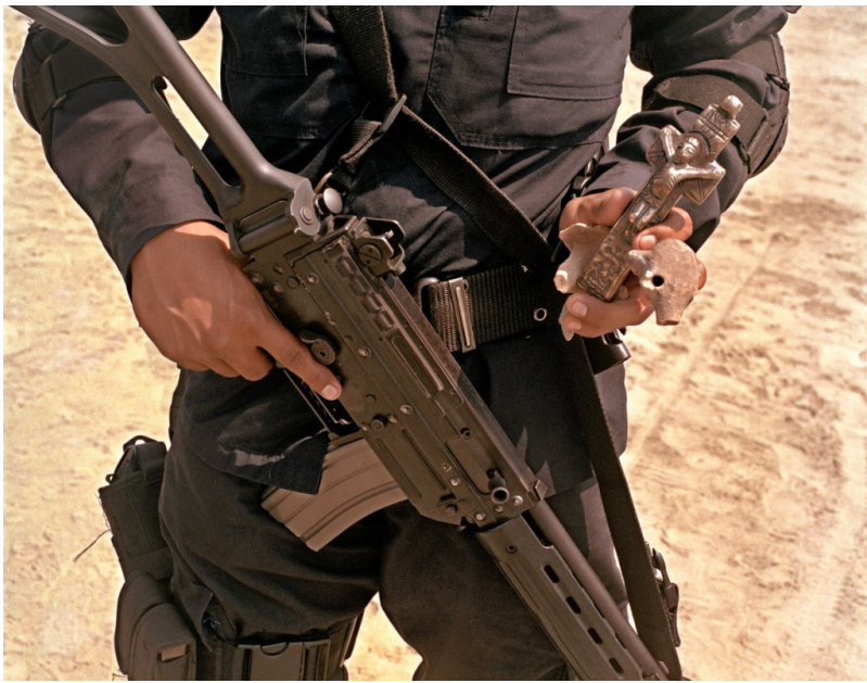
Oweena Fogarty, Veracruz Policía, Photograph, Courtesy the artist and Shaped in Mexico.

call. Open-call artists are selected through an inclusive curatorial model, composed by Elena Aparicio (Spain) & Olga Margarita Dávila (Mexico), in a process that aims to transcend all Mexican geo-political boundaries, and promote the dynamism of the Mexican contemporary art scene in Europe.