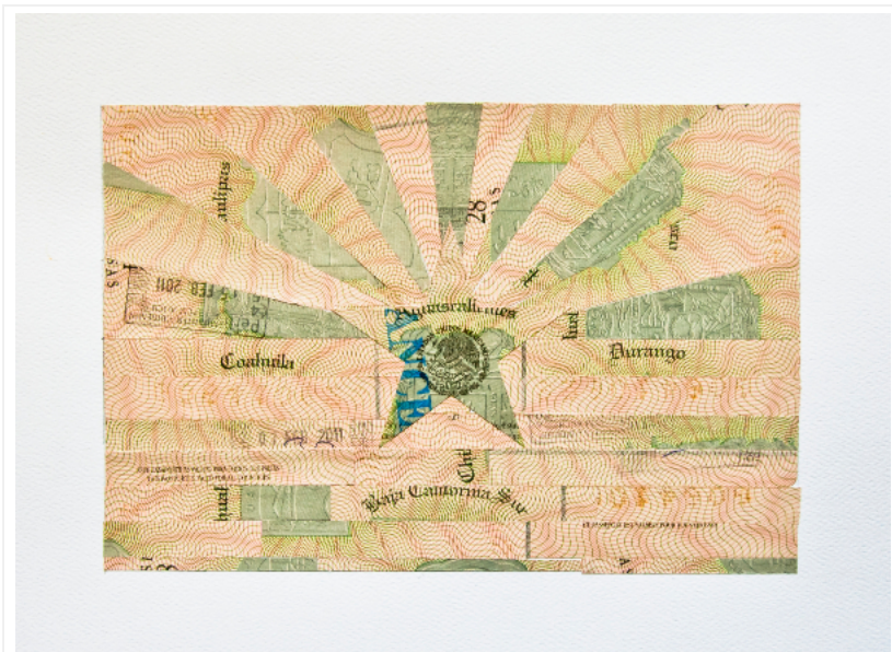
Christian Becerra, Mexicanofilia 2 (Bandera de Arizona), 2015, Paper collage with Mexican passport, 20 x 21.5 cm

Spanning 4 floors of show space, immersive large-scale installations, projects and specially commissioned performances will take place alongside a curated public programme of talks, music and events.