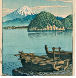
Hasui Kawase Summer Jasper52 Est: 550 USD