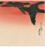
Shibata Zeshin Three Crows Jasper52 Est: 275 USD