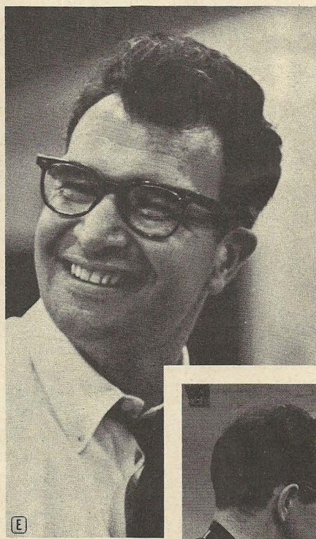
A. Louis Armstrong