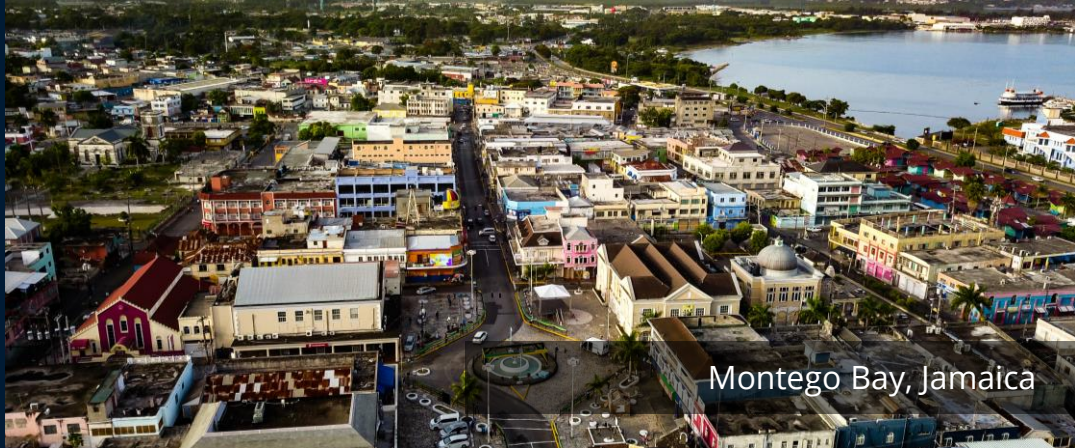
Montego Bay, Jamaica

Central America, South America, and the Caribbean