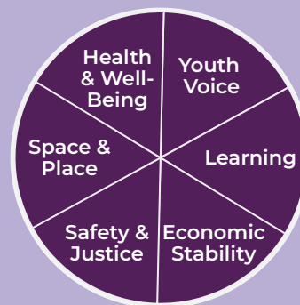
6 Youth Master Plan Areas

For each of these 15 solutions, the plan includes clear accountability approaches: action steps, timelines, and accountability with owners to drive the work forward.