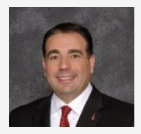
Sait Onal Productions For contributions to educating our communities and the world on human rights issues at home and abroad.