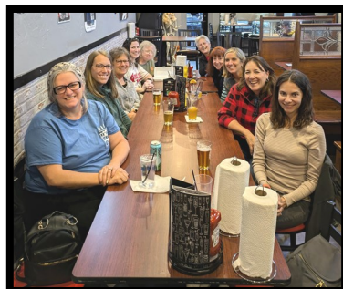
Fun time at Spunkmyers!