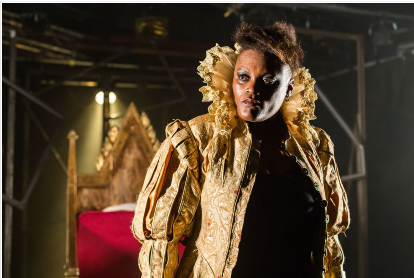
MARY STUART, Karamel Café, Mountview Academy