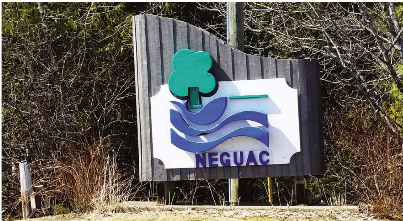
Rendez Vous Neguac Inc. 2016 is taking place in the Village of Neguac from Saturday, July 16, to Sunday, July 24.