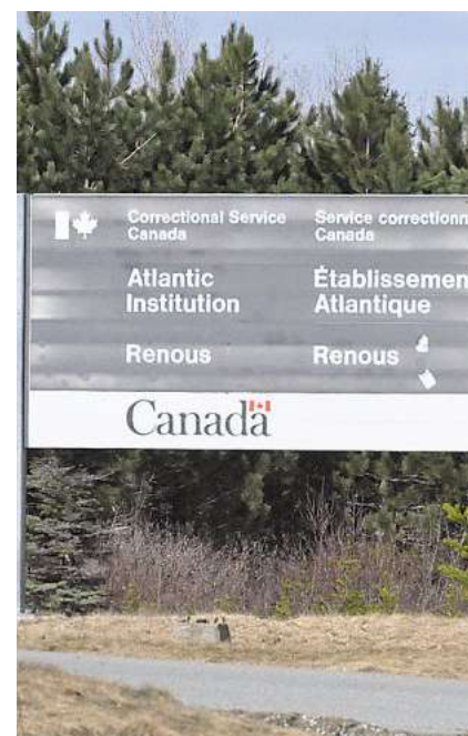
The Atlantic Institution is located in Renous