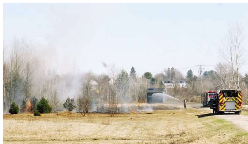
Firefighters spent more than 40 minutes putting out a fire behind James M. Hill Memorial High School on April 29, 2013.

With that in mind, the board passed a motion to reach out to the province in order to formally relay those concerns.