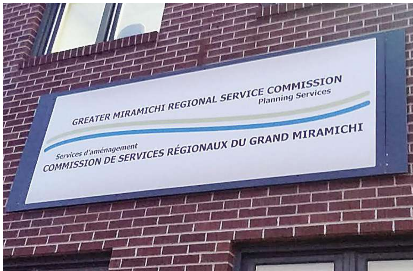
A look at the Greater Miramichi Regional Service Commission offices on Water Street. The commission's board of directors approved the organization's budget for 2017 during a meeting Tuesday, Nov. 15.