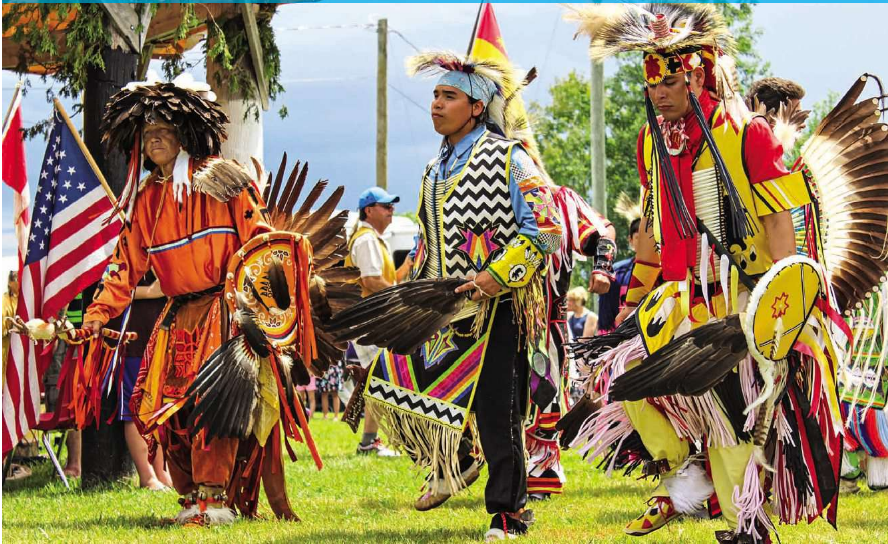
The annual Eel Ground First Nation Natoaganeg Powwow opened on Thursday, July 14, until Sunday, July 17. Pictured above are dancers dressed in traditional and grass dance regalia during the grand entry ceremony on Saturday, July 16. See inside for more photos from the powwow and online at miramichileader.com.