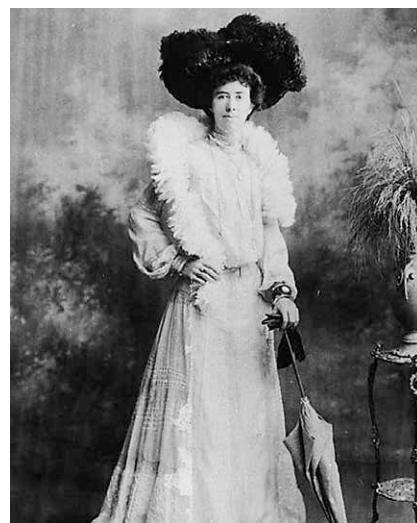
Woman, wearing a large feathered hat and boa, posing for a portrait.

With the treaty in place, few people are harvesting migratory birds without following federal regulations. However, habitat loss is a huge threat to migrating birds. Migratory birds depend on suitable breeding and wintering grounds and stopover sites, where they can rest