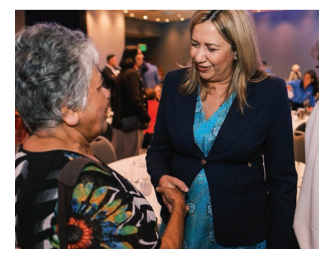
Premier Annastacia Palaszczuk MP wearing a dress from the Andrawilla Collection