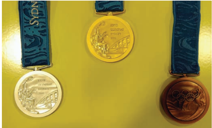
Sydney Olympics Medals