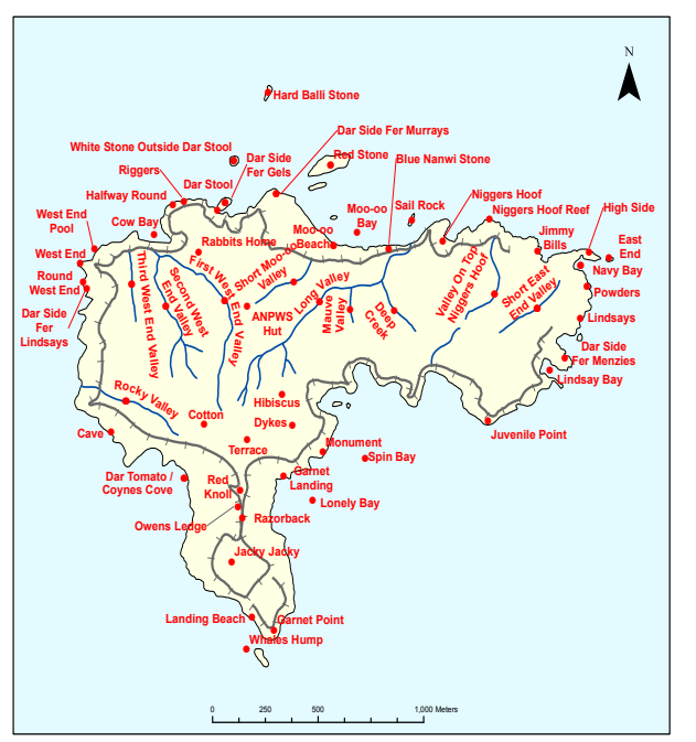
Map 1 – Combined toponymic map of Phillip Island

Although the placenames currently in regular use by the Norfolk Islanders (see Map 1) have been previously published (Australian National Parks and Wildlife Service 1989: 8), the former names on Coyne's Map<sup>1</sup> (see Map 2), commented on by the Norfolk community and eventually changed, served a practical and functional purpose during the rabbit eradication program-they provided utilitarian pointers for workers to locate themselves and to find their way around the island. I believe the current names came to be used because no one on Norfolk Island—of Pitcairn descent or not—told the ANPWS staff what the existing names were in the places where they were working. What is interesting is how and why these names have come to be changed, and what implications this has for the Norfolk community's view of toponymy, for notions of uniqueness, and also for the process of name changing in a situation that could be labelled as 'quasi-indigenous'. (Norf'k names