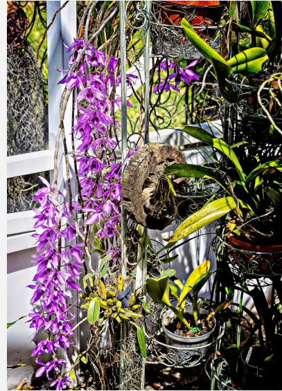
Dendrobium anosmum - Cheryl Dodes