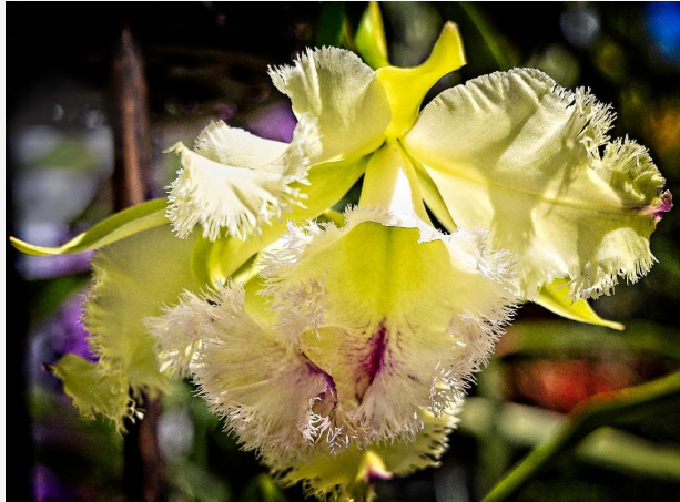
RLC Golf Green 'Hair Pig' - Cheryl Dodes