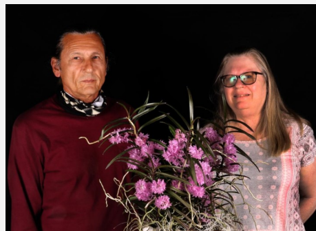
AOS Awarded Plants, March 2021