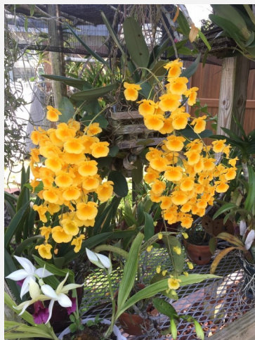
Dendrobium aggregatum - Belinda Krause