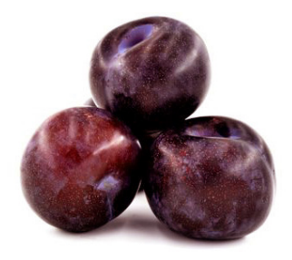
California pluol California: Mid-June – July

One of the older varieties of pluots, the shape of Sweet Treat is often described as "a little tippy." Often displays red casting in the flesh, making for lovely visual appeal.