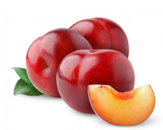
Santa Rosa plum California: Mid-June – July Northwest: August

This plum's slightly dusky appearance is thanks to the extra bloom that the skin of Hiromi Red holds. This plum does soften as it ripens, but the flesh still remains fairly firm.