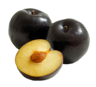
Black Kat plum California: August

The yellow flesh of this tasty plum sometimes showcases red veining that runs throughout. Stunning and delicious!