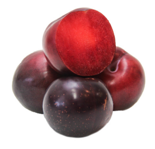
Flavor Heart pluol California: August

Recognizable by its slightly elongated shape, Crimson Royale is more reminiscent of a plum in flavor than appearance. Sweet and tangy, this pluot is tasty eaten out-of-hand or sliced in fruit salads.