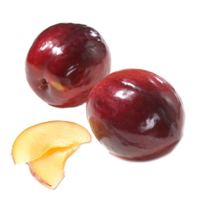
Flavor Fall pluol

This pluot gets sweeter and sweeter as it ripens while maintaining its crisp, toothsome texture.