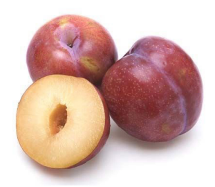
Sugar Jewel pluol California: July

Sweet, low in acid and juicy, this popular pluot is perfect for creating color breaks in displays. Surprise eaters with this unique yellow variety!