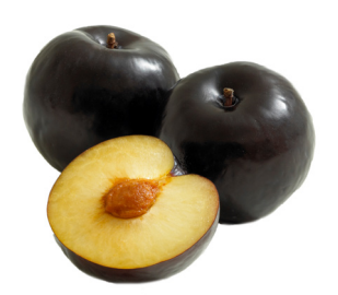
Howard Sun plum

AKA Howard Sun or October Sun. Black Kat is a well-rounded, late season variety that is delightful eaten fresh, but also is ideal for kitchen projects. Mostly free-stone this plum makes prep work pretty simple!