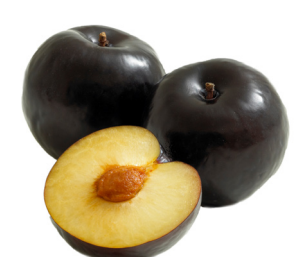
Fall Fiesta plum California: September

Calling all canners, bakers and jam-makers, this variety is well-loved for its culinary prowess. Full of flavor and delicious eaten fresh, its dense flesh holds up well to cooking. This plum is good for more than just a dried, chewy snack!