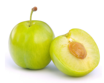
Flavor Queen pluol California: July

The bright color, tart skin and firm flesh of this mellow-flavored pluot make for a zingy and crisp eating experience. As it ripens, Emerald Blush will soften, developing the sugars for a sweeter taste and will begin to showcase a lovely pink blush. Available for a short window, jump on this chance to bring in this eye-catching pluot while it's on!