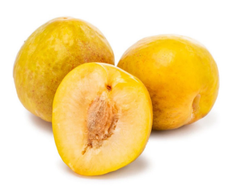
Flavor Grenade pluol

Extremely sweet and with taught skin that clings tightly to its flesh, Dapple Jack is a delightful eating experience!