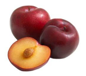
Crimson Royale pluol California: August

Tastes like fruit punch with a truly tropical kick, super sweet Honey Punch is a treat!