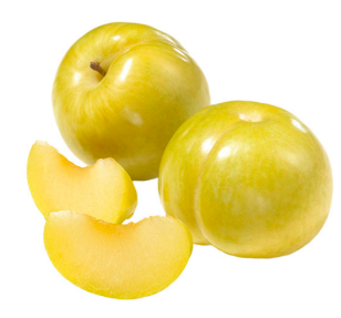
Mellow Yellow pluol California: July

High in sugar and in flavor, this pluot is an excellent eater. Flavor Gem is the red-skinned cousin of Flavor King, and oh what a delicious family it is!