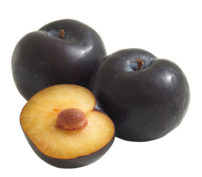
Black Friar plum California: July

Sizing up larger and with higher sugar content than its close relative Black Amber, Owen T is a phenomenal piece of fruit.