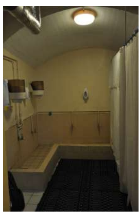
Manchester University Prayer Rooms (one located in the North Campus and one in the South Campus)