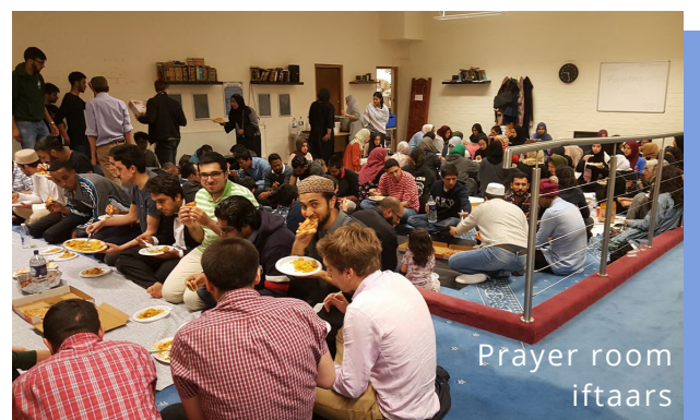
Prayer room iftaars

We host free term-time iftaars every day during the holy month of Ramadan, followed by Taraweeh. These Iftaars are the backbone of the Muslim community in Oxford, providing a space for everyone to come together and share a meal each night.