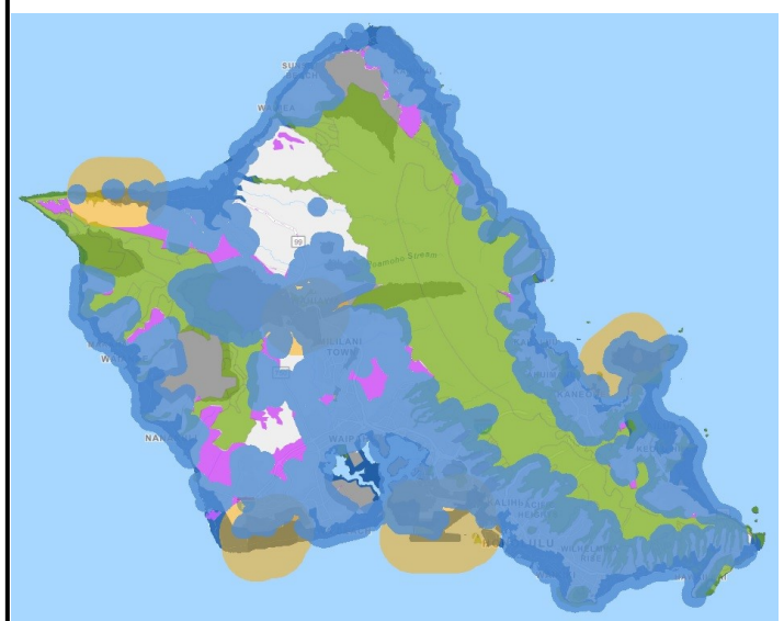
Landfill locations have been narrowed down to the four locations in the white areas.

Waimanalo Gulch Landfill near Ko Olina has been open since 1989 and has about 10 to 12 operable years left. The state Land Use Commission ruled in 2019 that Waimanalo Gulch must close by March 2, 2028, due to environmental justice