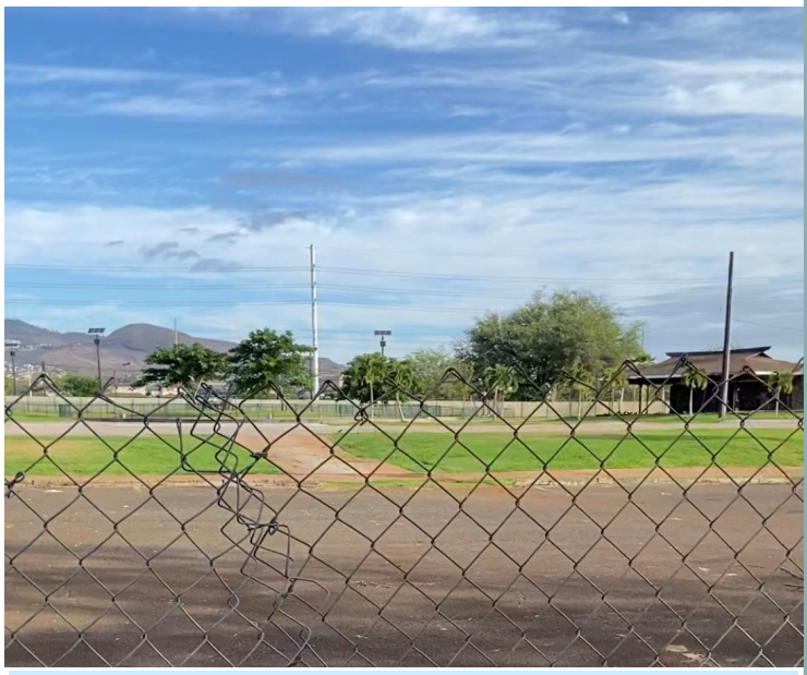
Future dog park coming to Kalaeloa (Date TBD).

friends can frolic there... another one of those old structures left over from the days of the Navy – this one an Well, folks we've got three hotels in Kapolei right now. The old bath house – that needs to go! No timeline on this yet,