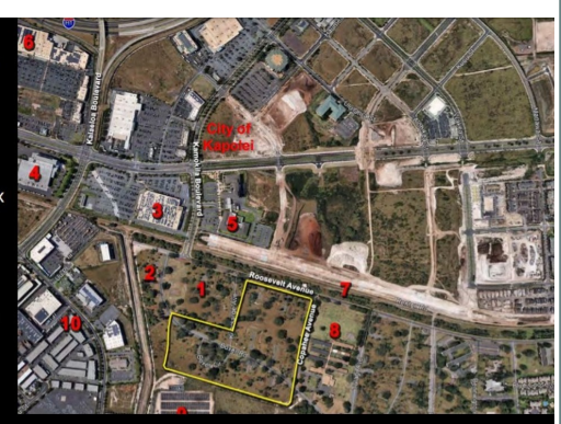
Gentry Homes: Ka'ulu

Ka'ulu coming to Kalaeloa. Estimated completion 2023.