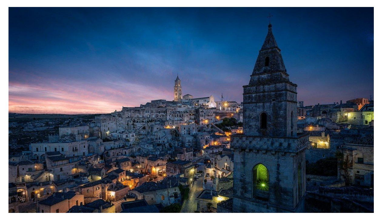
Day 4 | Matera and the Sassi (Ancient Town)

After arrival in Bari we are transferred Borgobianco Resort, Borgobianco Resort & Spa MGallery Hotel compliments its rural surroundings with local artwork and spectacular views. Bright white walls, vaulted ceilings and a traditional central courtyard combine to breathe life into large sun-drenched spaces. Enjoy exquisite Italian cuisine in the hotel restaurant.