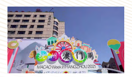
MARKETING CAMPAIGN (NATIONAL - ASIA)

Macao Week in China 2021 Macao Government Tourism Office, Macao, China