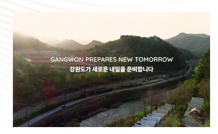
MARKETING CAMPAIGN (STATE AND CITY - GLOBAL)

Open for Happiness Campaign Tourism Fiji, Fiji