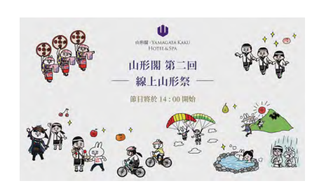
MARKETING - HOSPITALITY

<u>Say Bonjour To Paris</u> SriLankan Airlines, Sri Lanka