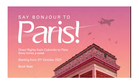
MARKETING - CARRIER

<u>Gangwon Worcation Project</u> <u>Gangwon Tourism Organization,</u> <u>Korea (ROK)</u>