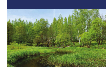
Bio-energy in Palestine between Reality and Potential