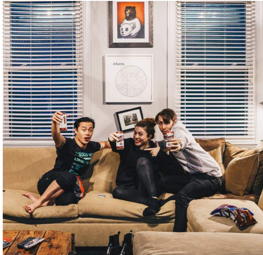
Atlanta, November 2018