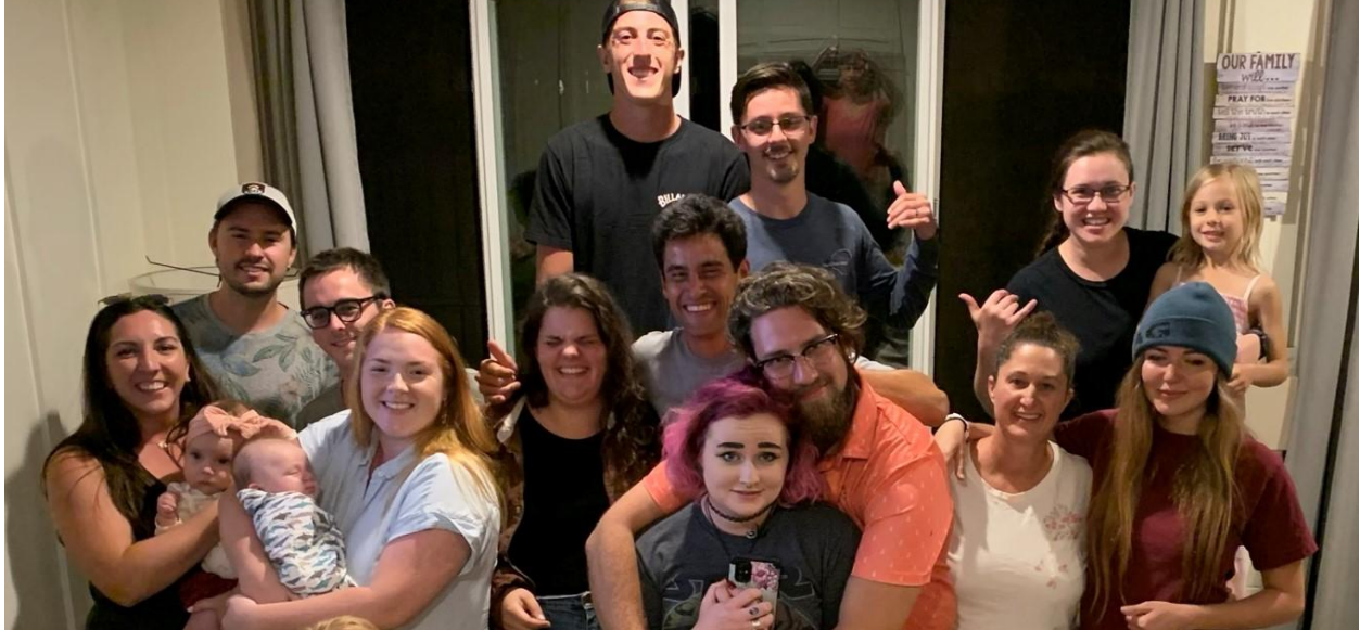
Kauai Bible College Reunion, Feb 2022