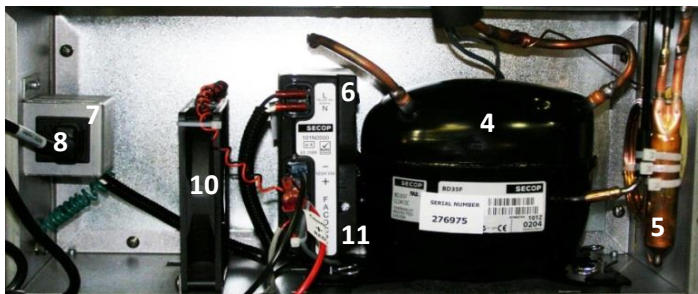
Base Expanded View

* DC models electronic 2000 replaces electronic AC/DC