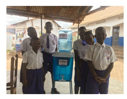
Nansana Royal Primary School counts 420 pupils. The school is located in the northwestern part of Kampala 8 Filters were installed

Tuli is partnering with SPOUTS where each Tuli bottle sold, one pupil gets access to safe drinking water in Uganda. You can pre-order your bottle at: https://www.https://tuli-project.com/