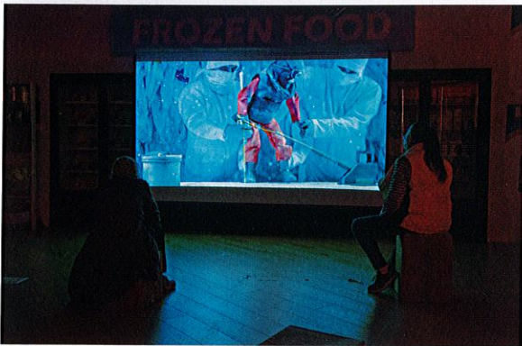
The Plastic Bag Store , by Robin Frohardt, projection from immersive puppet play.