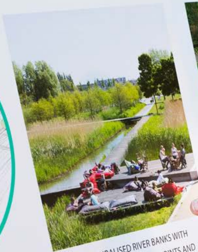
NATURALISED RIVER BANKS WITH PEDESTRIAN CROSSING POINTS AND TERRACES