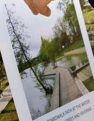
BOARDWALK PATH AT THE WATER LEVEL WITH TREES AND RIVERINE ECOLOGY