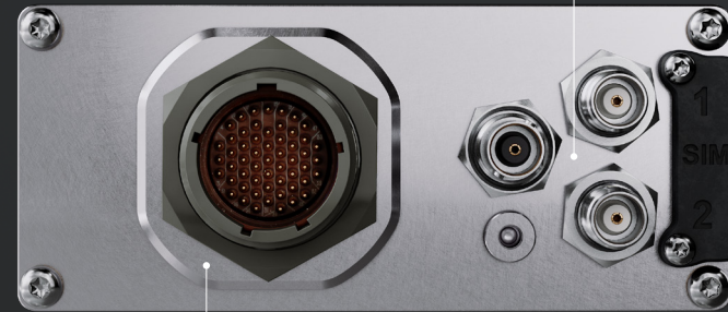
Military D38999 x1