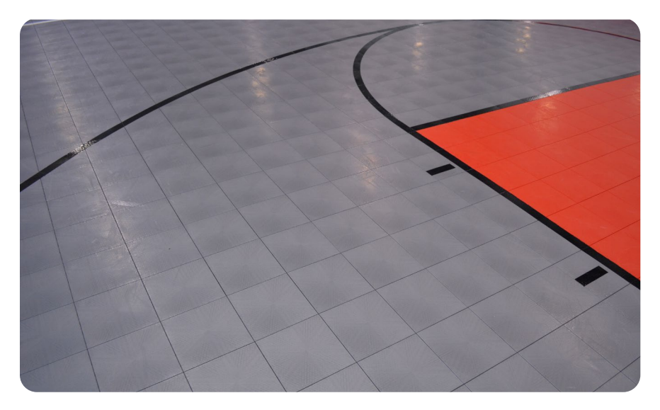
facility details + (lots of!) room for text overlay. (these simple photos are often missed but are very useful on websites)