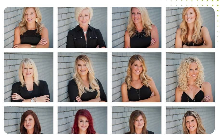
coordinated staff photos-square crops for gallery

room details + open background space for text