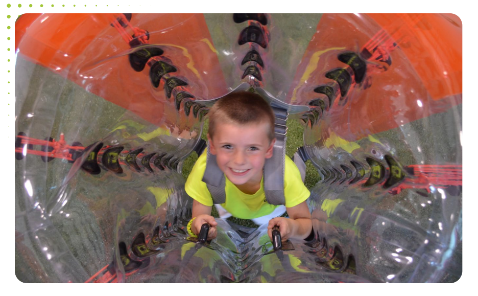
smiling participants & real customers