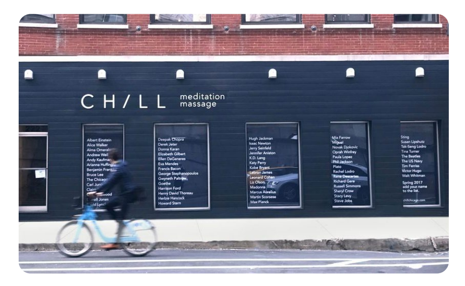
exterior shots help new customers find your studio & also helps show the full in-person experience