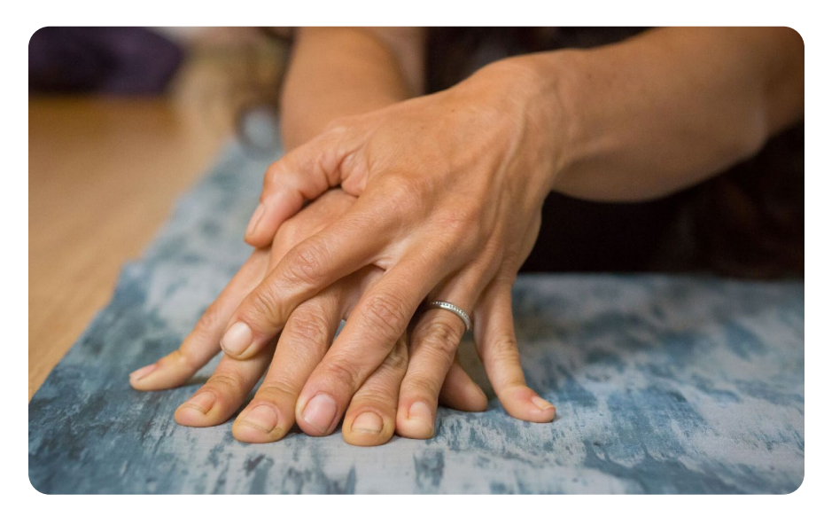
close-in shot to show details of class experience