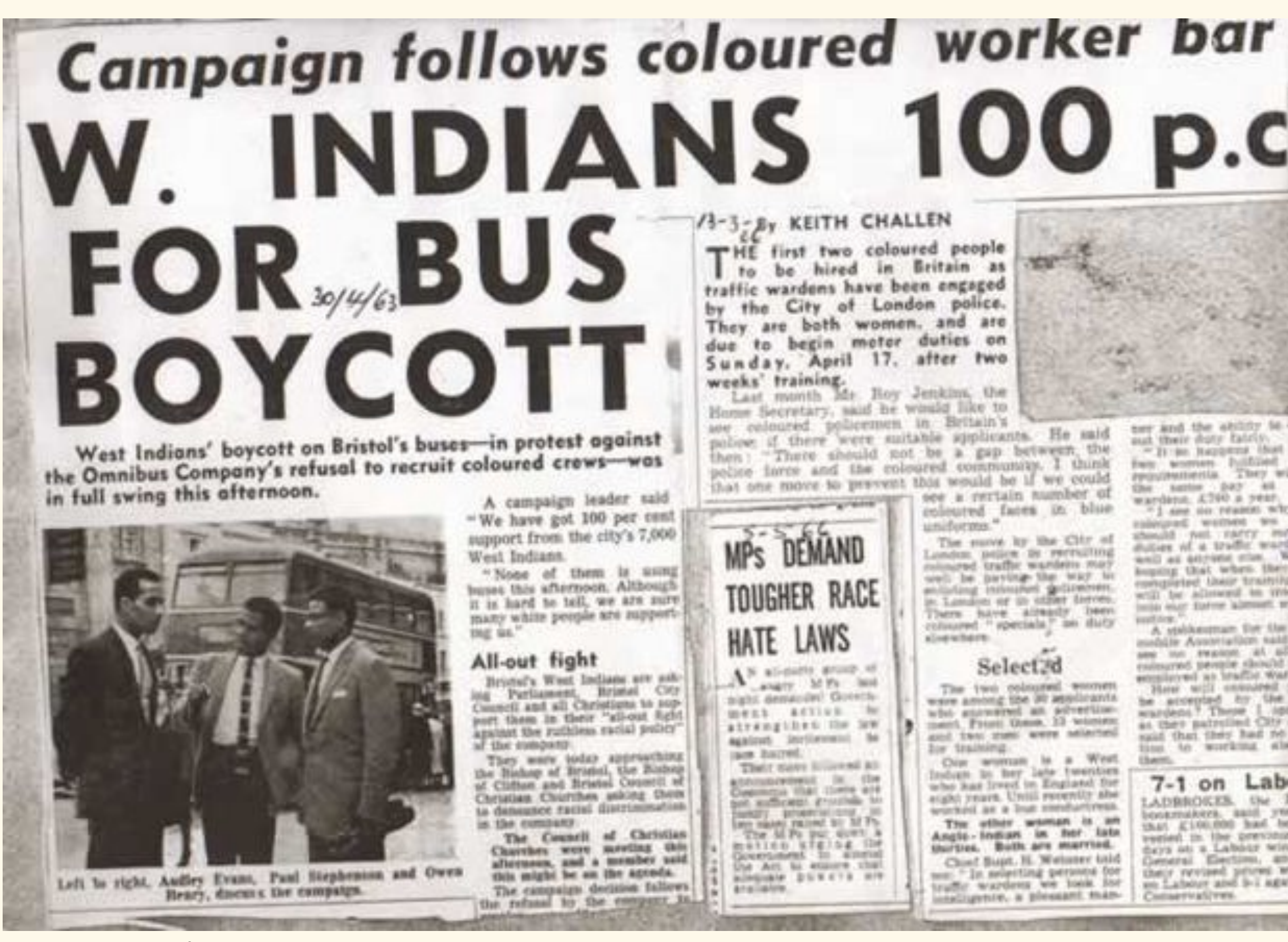
Newspaper article of the Bristol Bus Boycott