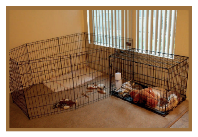
Here's are examples of a puppy's "room", made of a portable, wire exercise pen & crate with bed, toys and water.