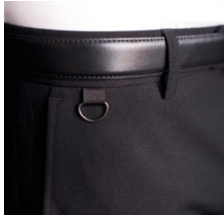
Images Above Olympia Mens Trousers Black