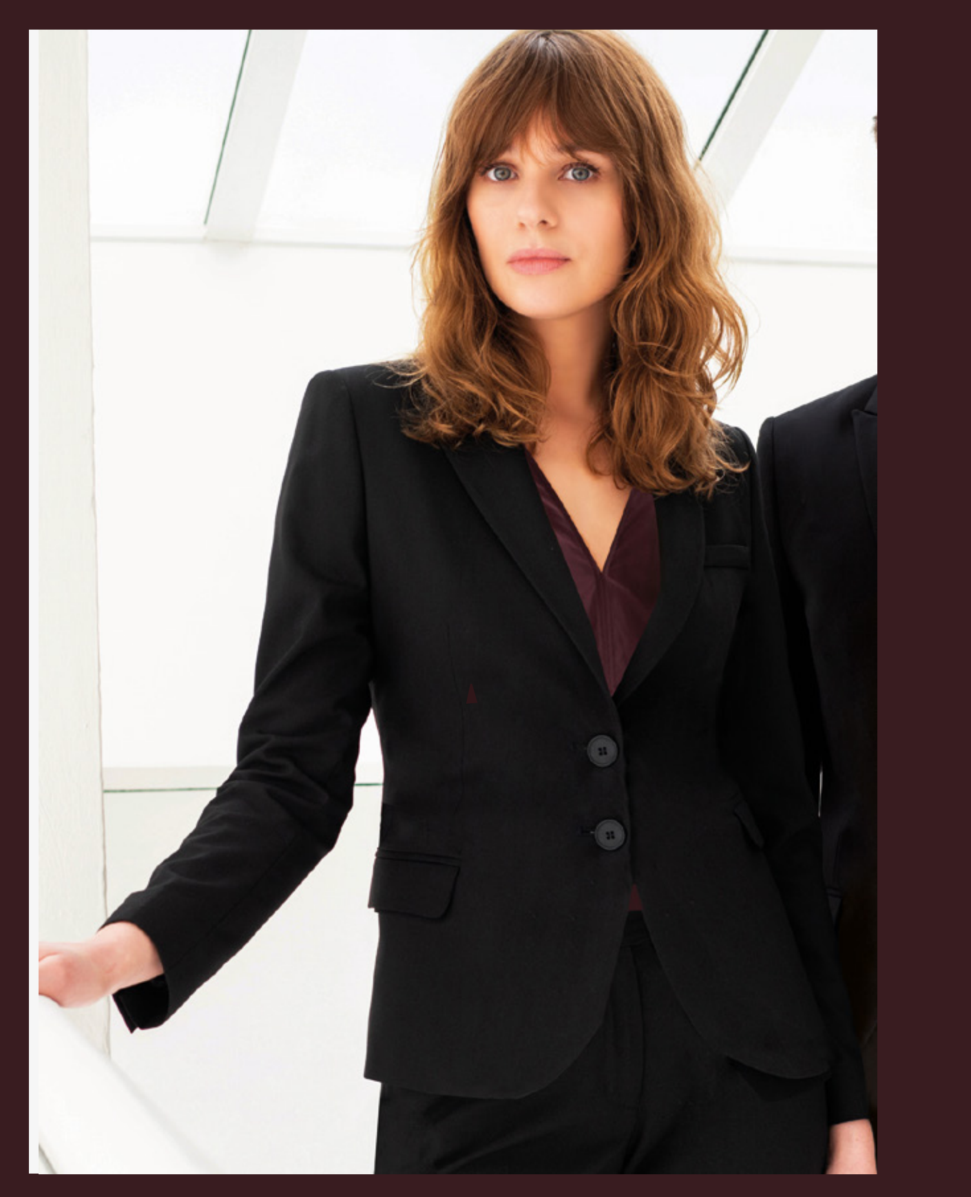
Temple Ladies Jacket Pentonville Ladies Trousers Black