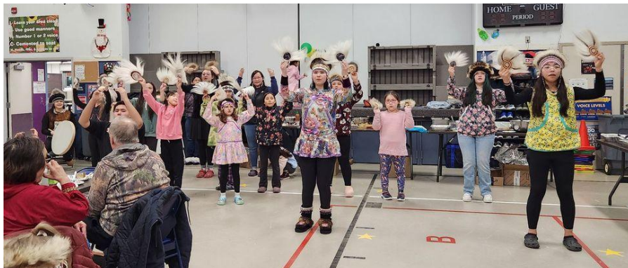
Curyugmuit Yup'ik Dancers at the 2025 Beaver Round Up Traditional Foods Feast