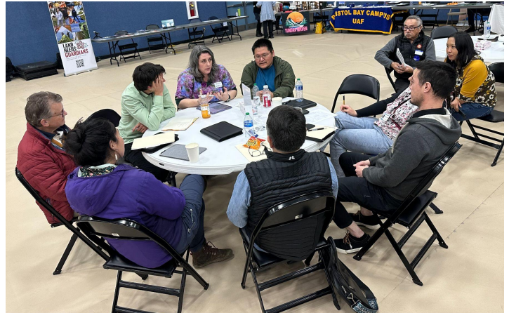
Attendees at the 2024 Sustainability Summit connect to discuss solutions to local issues.

In the meantime, visit our website to find videos and resources from past summits.