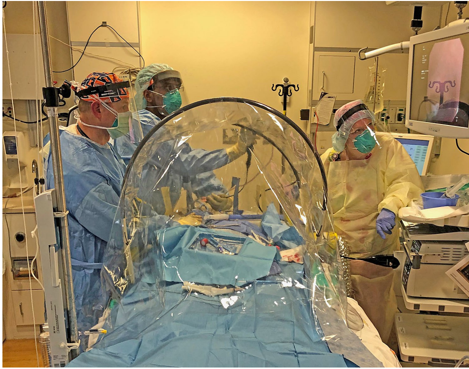
Fig. 3 Bronchoscopy and tracheostomy performed within the AerosolVE tent—Case 2

desaturation with even brief discontinuation of mechanical ventilation.