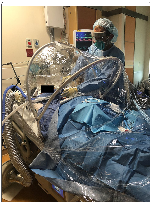
Fig. 2 Performance of tracheostomy within the AerosolVE tent—Case 3

with a history of hypertension, with COVID-19-related acute respiratory distress syndrome (ARDS), prolonged unresponsiveness, and multiple bilateral borderzone ischemic strokes intubated 21 days prior to tracheostomy. He was weaned to a \text{FiO}_2 of 40% and positive end-expiratory pressure (PEEP) of 8 cmH 2 O, but failed multiple spontaneous breathing trials (SBT) and was insufficiently responsive to reliably protect his airway. He also remained unresponsive to pain when weaned off all sedation. The second patient was a 53-year-old woman with a history of hypertension, diabetes, coronary artery disease, mitral valve replacement, and COVID-19 who in addition to ARDS also suffered cerebellar hemorrhage, hydrocephalus, and acute severe myopathy. She was intubated 26 days prior to tracheostomy. This patient had been weaned to \text{FiO}_2 40% and PEEP 10 cmH 2 O but also failed multiple SBTs and was unable to protect her airway. The third patient was a 69-year-old morbidly obese man with diabetes, hypertension, and coronary artery disease intubated 21 days prior to tracheostomy for COVID-19 associated ARDS. He was on \text{FiO}_2 50% and PEEP 12 cm H 2 O and could not be weaned further.