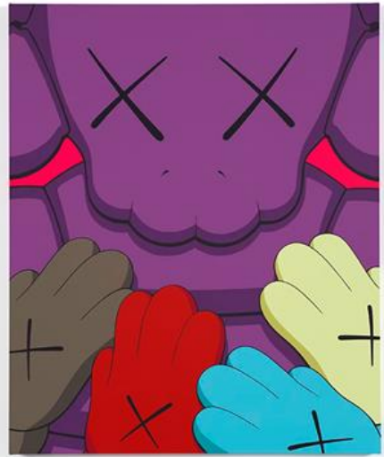
KAWS URGE (KUA9) , 2020 Estimate : $120,000 - $180,000