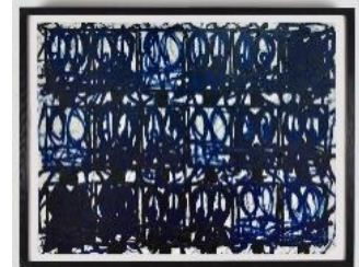
Rashid Johnson Untitled Anxious Bruise Drawing , 2021 Estimate : $90,000 - $120,000