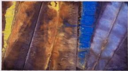
Sam Gilliam Untitled , 2021 Estimate : $80,000 - $120,000