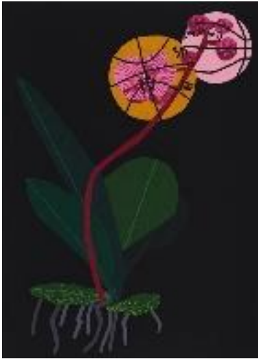
Jonas Wood Mini Purple Bball Orchid , 2021 Estimate : $200,000 - $300,000