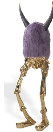
The Haas Brothers Biggy Stardust , 2020 Estimate : $120,000 - $180,000