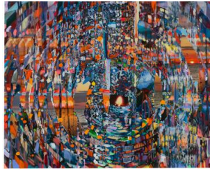
Sarah Sze Fast Forward , 2021 Estimate : $80,000 - $120,000