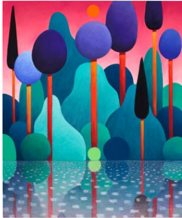
NICOLAS PARTY (B. 1980)