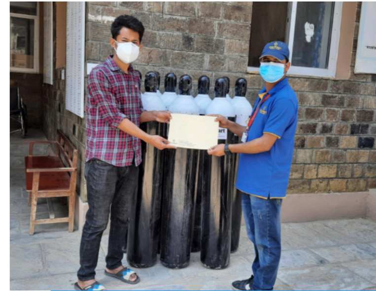
OHW team handing over oxygen cylinders to rural Mehnikot Hospital in Kavreplanchowk, one of Nepal's most affected districts.

In addition, the United Nations (UN) launched the Nepal COVID-19 Response Plan on 21 May 2021 calling for financial support of $83.7 million to mobilize emergency response over the next three months to assist the most vulnerable affected by the pandemic.