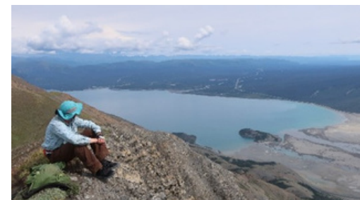
On a mountain overlooking Kluane Lake while walking across the Yukon during my walk.

Under the guidance of Donny and Ray, the three of us have been implementing multi-criteria decision tools and developed a geospatial (geographic) modelling approach to assist clients in determining the vulnerability of their pipeline crossings for Environmental Protection Planning (enter the EPP pathway). Instead of characterizing the uncertainty of a pipeline's vulnerability using classical approaches that are best suited for problems with a binary or linear outcome, we have veered to the edge of probability measurement. Typically, we characterize uncertainty by the rolling of a dice or flip of a coin (probability), however, for the problems faced by emergency response and preparedness planning a different tool box is required. That toolbox consists of criteria, fuzzy set theory, Geographic Information System (GIS), multicriteria decision analysis, and an order weighted averaging algorithm to rank each pipeline crossing through the eyes of an emergency response expert (our decision-making space). It's been a challenging path with many highs and lows, but who ever said making a decision was easy!