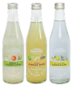
330ML GLASS Premium Soda RTD

Pour over ice cream to make a delicious ice cream soda or spider.