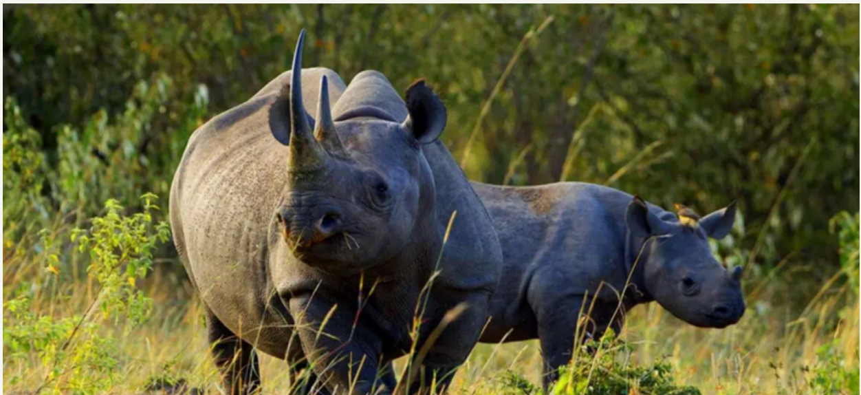
Rhino in Aberdare National Park, Kenya.

The Aberdares and Mount Kenya are protected within a national park and is home to diverse landscapes and wildlife. The ranges collectively support most of the country's surviving Afro-montane Forest and Afro-alpine moorland. Within the mountainous peaks and deep valleys live many animals including lions, leopards, elephants, black rhinoceroses and over 250 bird species. The soil around the national park in this coffee growing region is renowned for its high fertility and good drainage during the rainy seasons.