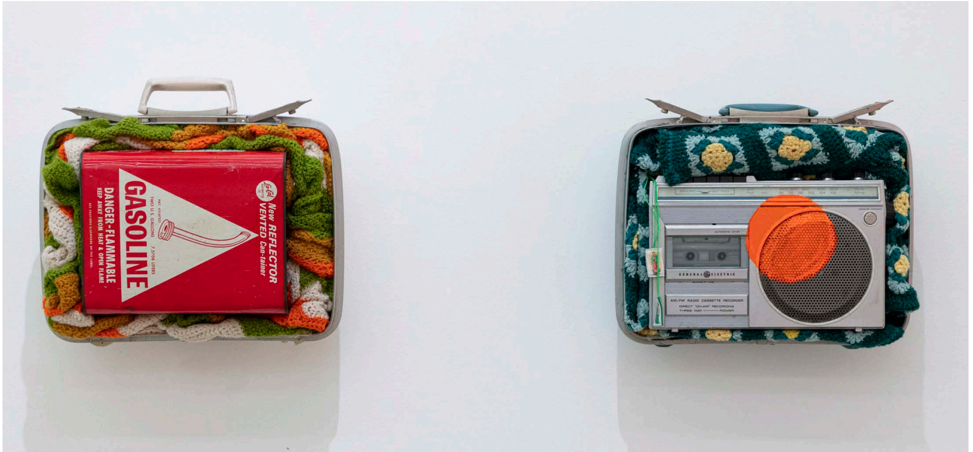
Lorena Ochoa American Pride Hard Shell Suitcase, Crocheted Blanket, Granny Square Jacket, Gas Can, Acrylic on Boom Box, and American Pride: Songs of God and Country Cassette 14 x 18 inches / each 2023