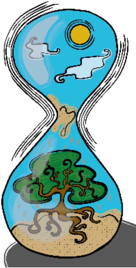
Figure 1. Fragile Peace: A vision for the future of food security in Northwest Syria in the next 5 years (reproduced from Boden et al. 2022)