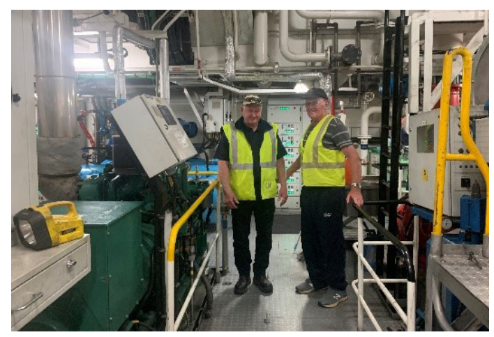
Image: Shedders enjoy checking out Smit Lamnalco's massive 90 tonne bollard pull tugs in Gladstone Harbour.