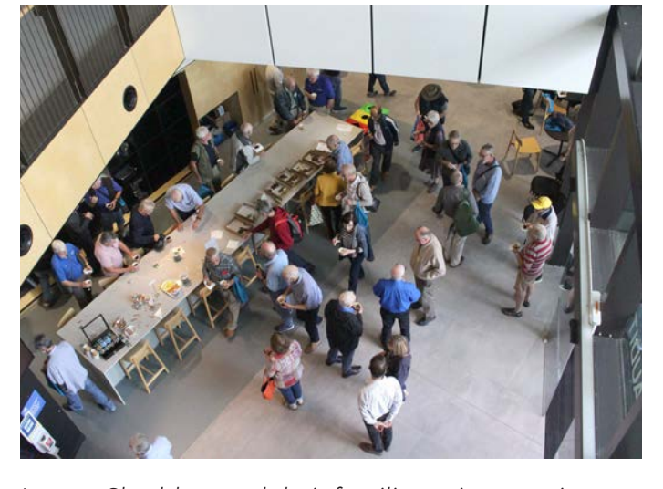
Shedders and their families enjoy morning tea between sessions.

What was it like? Altogether there were 15 speakers, some academic staff and researchers