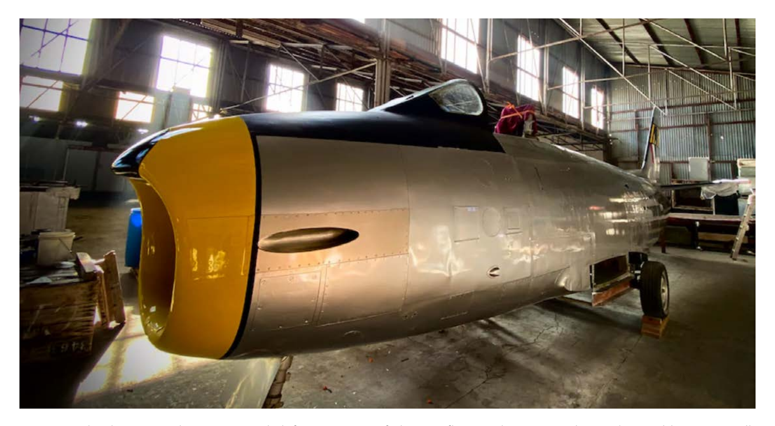
The CA-27 Sabre was Australia's first supersonic fighter jet, flown in the 1950s and 1960s.