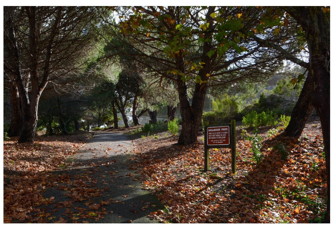
Hallmark Park, located on the western edge of Belmont, features a playground, tennis courts and trails connecting to other open spaces in Belmont.

acres of private common open space and three acres of marshland. San Juan Canyon and Water Dog Lake provide outdoor recreational opportunities for the community, including hiking and biking trails and access to other open space networks in the region, such as the Sugarloaf Open Space. Providing sufficient resources to manage and improve the city's open spaces and trails has been a priority identified by Belmont community members throughout the General Plan Update process.