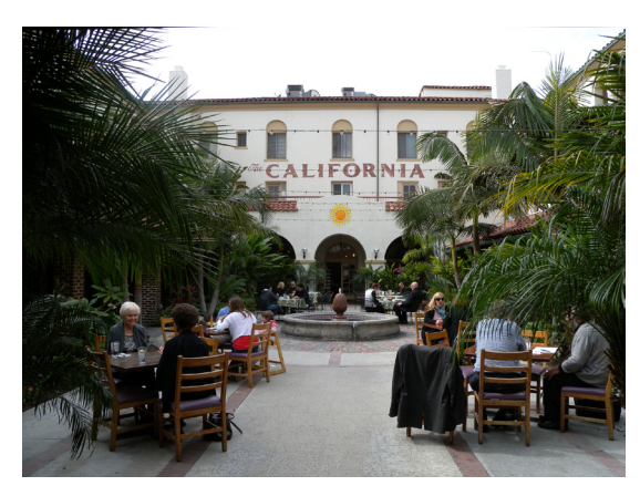
Most new public open spaces in the Belmont Priority Development Area (PDA) will be plazas and mini parks, incorporated into the urban environment

neighborhood and mini parks. Based on the city's 2013 population of 26,400 and the existing park facilities totaling 112.2 acres, Belmont provides an overall ratio of 4.3 acres of park area per 1,000 residents. This figure is below the General Plan and Master Plan standard of 5.0 acres of parkland per 1,000 residents. Additionally, this figure includes twot undeveloped park areas, as well as about 23 acres of school park area that are under a joint use agreement with the City, which is up for renewal in 2019. If the joint use agreement is not renewed, the Belmont community could potentially face an even greater shortage of parks and recreational facilities.