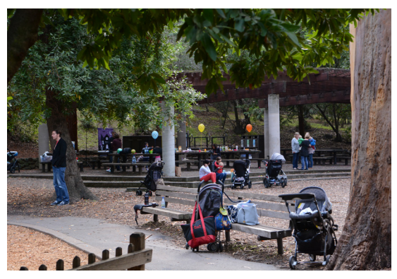
Belmont's parks help create a sense of community.