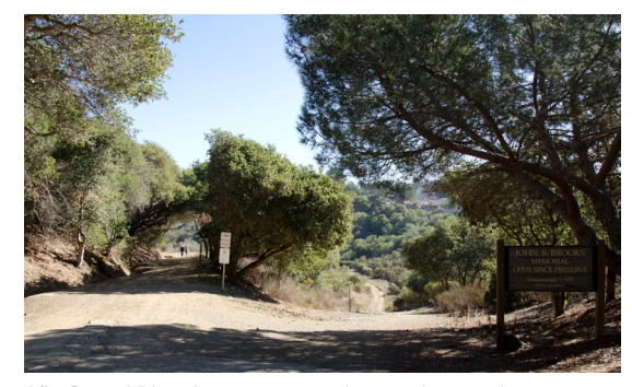
The General Plan aims to preserve and protect the natural open space in Belmont.

"nexus" between new development that occurs within the city and the need for additional facilities as a result of new development. In October 2014, the City of Belmont published a Park Impact Fee Nexus Study to meet the Mitigation Fee Act requirements.