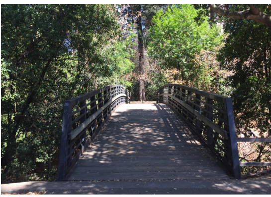
Twin Pines Park offers outdoor amenities for residents and access to Belmont Creek.