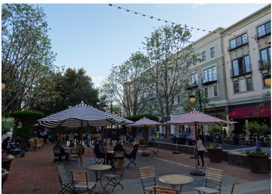
The General Plan aims to create a extensive system of parks, plazas, and other open spaces that serves the entire Belmont community, enhances community identity, and is conveniently located for community use