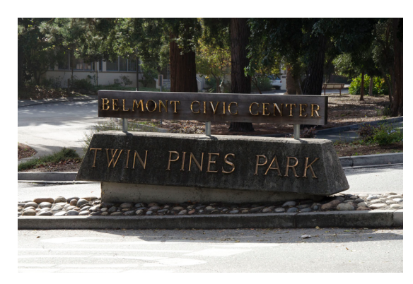
Twin Pines Park is the largest park and recreational facility serving Belmont residents.