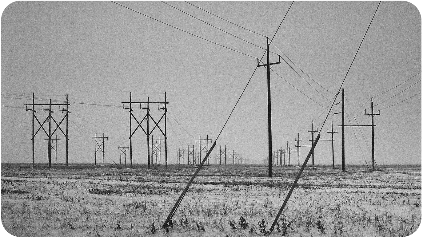
Do you have a photo that is taken in the Interlake Region? We want to see! osc@creativecommunitypromotions.ca