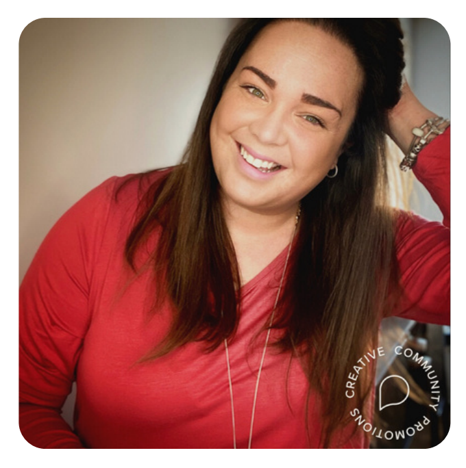
"Leadership is not about titles, positions, or work hours. It's about relationships."

I would like to think that I am a strong leader but recently I was debating about putting my name forward for the 2022 Gimli Chamber of Commerce Election for president. It was a difficult decision to make and I had to do some research and self-reflection first. I will share some of my findings with all of you.